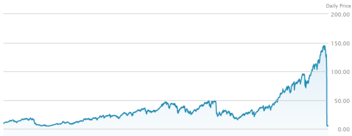
VelocityShares Daily Inverse XIV Short-Term ETN

There's only so much the VIX future can take. The lemurs followed each other and jumped off the cliff together. In fine, the VIX moved so much that the two ETFs had lost 90 and 95% of their worth. In one day. In hindsight, building a reverse ETF on such a complicated, difficult to hedge and unstable underlying will probably not be remembered as the smartest idea.