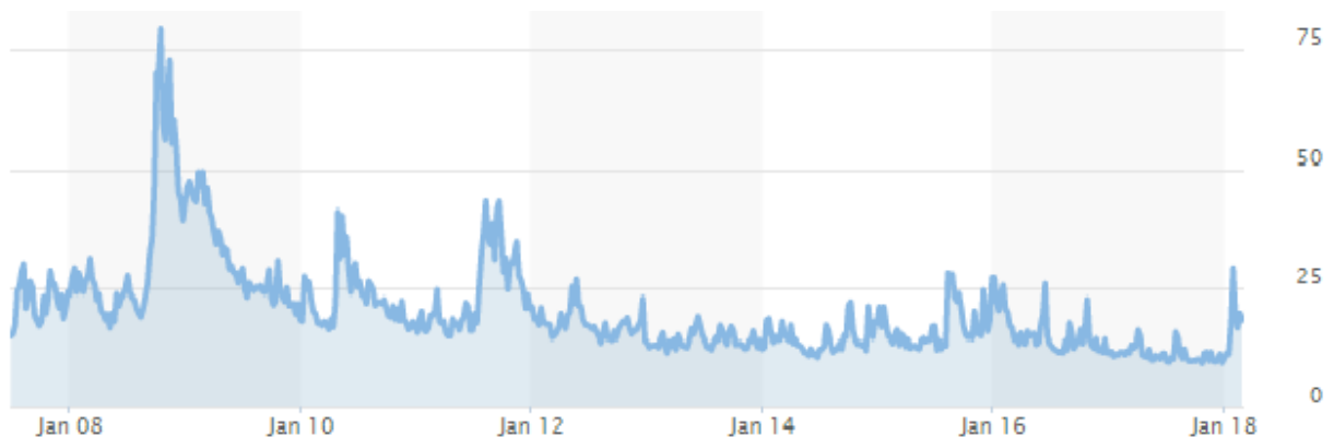
CBOE VIX index (2008-2018)

Equity index volatilities, on the other hand, are much harder to forecast. They have no trend, forcing them to mean-revert. Their trajectories are far from oscillating around their average: they tend to gap up and smooth down exponentially. Vol traders know this drill well – buy it cheap ahead of possible events, try to sooth the theta-negative cost with calendar spreads, skew or out-of-the-money positions, and enjoy the fruits of a vol gap up. You then sell short when everybody is scared and wait until it goes back down. Repeat.